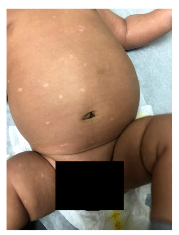
Figure 13. Hypopigmented macules in confetti pattern in tuberous sclerosis.

autosomal dominant, multisystem disorder characterized by a mutation in the NF1 gene on chromosome 17 that codes for neurofibromin, a protein that regulates cell division in the nervous system. (89) The mutation causes fibrous benign tumors that originate from the central or peripheral nervous system. (90) Clinical characteristics of NF1 are age-dependent; however, \sim 97% of individuals meet the diagnostic criteria by age 8 years. (91) The most common manifestations affecting greater than 99% of NFI individuals are cutaneous neurofibromas and café au lait macules (CALMs) (Fig 12). (89) Neurofibromas can occur anywhere on the body and present as pedunculated, firm to rubbery nodules. The presence of 6 or more CALMs, greater than 5 mm prepubertal or greater than 15 mm postpubertal, and more than 2 neurofibromas or 1 plexiform neurofibroma are suggestive diagnostic findings of NF1. (89) An additional diagnostic criterion is freckling in intertriginous and sunexposed areas, seen in 85% of pediatric patients, particularly axillary freckling, referred to as the "Crowe sign", which occurs at a later age than CALMs but before the appearance of neurofibromas. (89)(92) The ophthalmological finding of 2 or more Lisch nodules is usually seen before age 5 years and with increasing appearance frequency as individuals age. (89) In addition, the presence of an optic glioma; distinctive osseous lesions, such as sphenoid wing dysplasia; or having