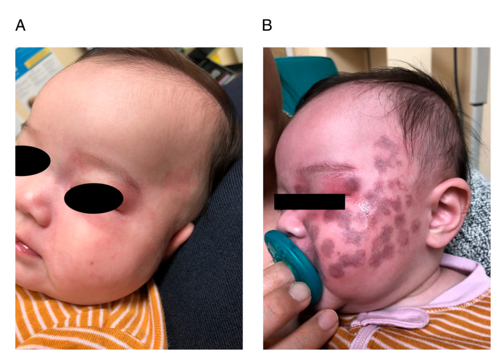
Figure 3. Port wine birthmark on left face before treatment (A), note the purpura right after a pulsed-dye laser treatment, which is the expected end point (B).

infantile hemangioma (Fig 4) may predict complications such as obstruction or interference with vital structures. Also, multiple hemangiomas (≥5) may be an indication of involvement within internal organs, such as the brain, liver, and spleen, and appropriate diagnostic tests should be ordered. (51) The primary form of treatment is the non-selective β-blocker, propranolol. (52) Small superficial infantile hemangiomas may respond well to the use of topical timolol. (52) Infantile hemangiomas presenting in the diaper area and skin creases are susceptible to ulceration and infection; thus, topical and systemic antibiotics, in addition to protective dressings and pastes, may be used. Pulsed-dye laser has also been shown to be