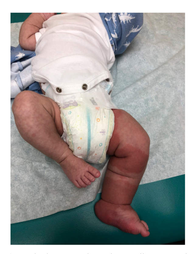
Figure 9. Klippel-Trenaunay syndrome with segmental hemangioma and hemihypertrophy of left lower limb.

abdominopelvic involvement. (69) Patients with KTS are prone to developing deep vein thrombosis, chronic thromboembolic pulmonary hypertension, and pulmonary embolism. An elevated D-dimer and low fibrinogen levels reflect chronic intravascular coagulopathy due to an abnormal venous network. Prophylactic anticoagulation can be prescribed for those with evidence and risk factors for hypercoagulability. (70) Some suggest periodic echocardiography to assess for pulmonary hypertension. (71) Internal organs and soft tissues can also be affected by vascular malformations that may bleed and lead to anemia. In the case of gastrointestinal bleeding, colonoscopy or capsule endoscopy is warranted and may reveal dilated venous channels. (69) Surgical epiphysiodesis (surgical ablation of a physis to stop its future growth) is indicated for leg length discrepancy, which can exceed 2 cm at skeletal maturity. (68) Pulsed-dye laser is an effective treatment for cutaneous vascular malformations. Sirolimus has been investigated for vascular abnormalities and PROS with some benefit. (59) The most promising treatment option available is targeted therapy with alpelisib, a PIK3CA inhibitor, which can reduce PROS lesions. The starting dose is 50 mg daily with food for children age 2 to 18 years and can be gradually increased to 125 mg daily in