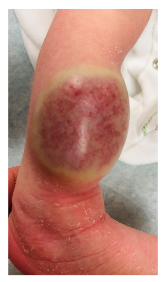
Figure 5. Congenital hemangioma on right lower leg.

specialists would be prudent, along with ordering an echocardiogram and magnetic resonance imaging (MRI) and magnetic resonance angiography (MRA) of the head and neck. (55)