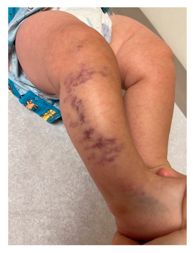
Figure 2. Cutis marmorata telangiectatica congenita.

Lamellar ichthyosis is a genodermatosis that is inherited in an autosomal recessive manner. (42) Transglutaminase-I ( TGM-1 ) gene mutations have been known to cause more than 40% of its cases. (42)(43)(44) Lack of TGM-1 activity leads to defective cornification and desquamation as a result of impaired cross-linking of proteins and lipids. (45) Newborns typically present encased in a collodion membrane. After 2 to 3 weeks, desquamation occurs resulting in diffusely large, thick scales predominantly in the flexural areas, forehead, and lower extremities. (46)