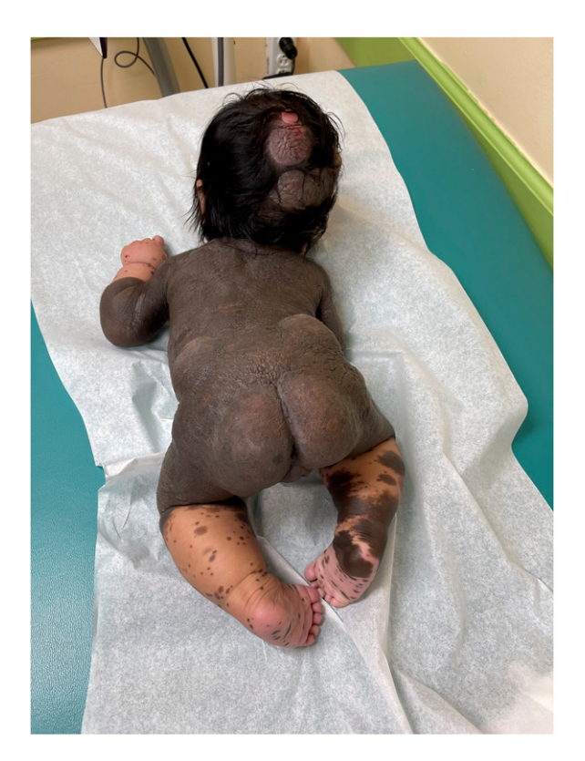
Figure 14. Giant melanocytic nevus in SCALP syndrome.

can present in the skin, brain, eyes, and kidneys. The pathophysiology of TSC involves a classical triad of mental retardation, seizures, and cutaneous findings, including facial or ungual angiofibromas, shagreen patches, and ash-leaf marks. (69) Around 83% to 90% of Tuberous Sclerosis cases exhibit facial angiofibromas, which typically manifest during the first 10 years of life, typically appearing around the ages of 3 or 4 years. (97) Ash-leaf marks, hypopigmented macules greater than 5 mm with 1 round end and I pointed end, appear in 90% of cases, usually at birth or early childhood, and at least half of cases by age 2 years; in fewer cases, approximately 2% to 20%, "confetti lesions," which are hypopigmented 1- to 3-mm macules, may present throughout the trunk or extremities (Fig 13). (97)(98) Shagreen patches, a connective tissue hamartoma with a fibrous texture and peau d'orange appearance, usually present on the lumbosacral region within the first decade after birth in nearly 50% of cases. (98)