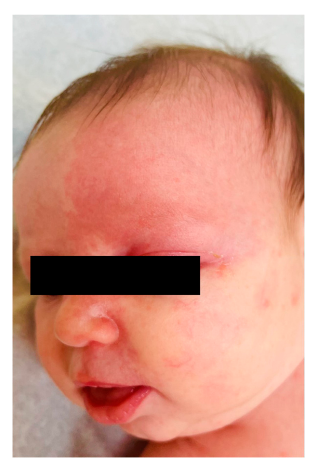
Figure 10. Port wine birthmark of Sturge-Weber Syndrome.

abdominopelvic involvement. (69) Patients with KTS are prone to developing deep vein thrombosis, chronic thromboembolic pulmonary hypertension, and pulmonary embolism. An elevated D-dimer and low fibrinogen levels reflect chronic intravascular coagulopathy due to an abnormal venous network. Prophylactic anticoagulation can be prescribed for those with evidence and risk factors for hypercoagulability. (70) Some suggest periodic echocardiography to assess for pulmonary hypertension. (71) Internal organs and soft tissues can also be affected by vascular malformations that may bleed and lead to anemia. In the case of gastrointestinal bleeding, colonoscopy or capsule endoscopy is warranted and may reveal dilated venous channels. (69) Surgical epiphysiodesis (surgical ablation of a physis to stop its future growth) is indicated for leg length discrepancy, which can exceed 2 cm at skeletal maturity. (68) Pulsed-dye laser is an effective treatment for cutaneous vascular malformations. Sirolimus has been investigated for vascular abnormalities and PROS with some benefit. (59) The most promising treatment option available is targeted therapy with alpelisib, a PIK3CA inhibitor, which can reduce PROS lesions. The starting dose is 50 mg daily with food for children age 2 to 18 years and can be gradually increased to 125 mg daily in