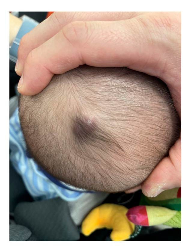
Figure 1. Hair collar sign of aplasia cutis congenita.

Congenital toxoplasmosis occurs when the mother has been acutely infected with Toxoplasma gondii during gestation. (2) The definitive hosts of T gondii , a protozoan in contaminated water and food, are cats and other animals included in the feline species. (3)(4) The cutaneous evidence of congenital infection appears as generalized erythematous macules, papules, and purpura. An infant with these skin findings can be described as a "blueberry muffin" baby, a term used for neonates with multiple bluish purplish papules and nodules. These papules and nodules are due to the presence of clusters of extramedullary erythropoiesis or purpura, which can occur in all TORCH infections (most common in rubella and cytomegalovirus). (2) The pathognomonic triad of toxoplasmosis is