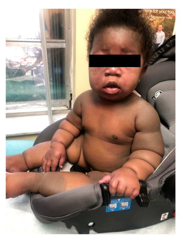
Figure 8. PIK3CA-related overgrowth spectrum with capillary malformation on face and left upper extremity overgrowth.

KTS (Fig 9) is characterized by a PWB vascular malformation in the form of a combined capillary-venous malformation or capillary-lymphatic-venous malformation and by hemihypertrophy of the affected limb. (62) Vascular malformations are usually present at birth or during early infancy. Superficial veins and venous varicosities are apparent by age 12 years, predisposing patients to thrombophlebitis. (63) A persistent embryonic lateral margin vein, a form of embryologically defective vein with malformation of the vascular trunk, is