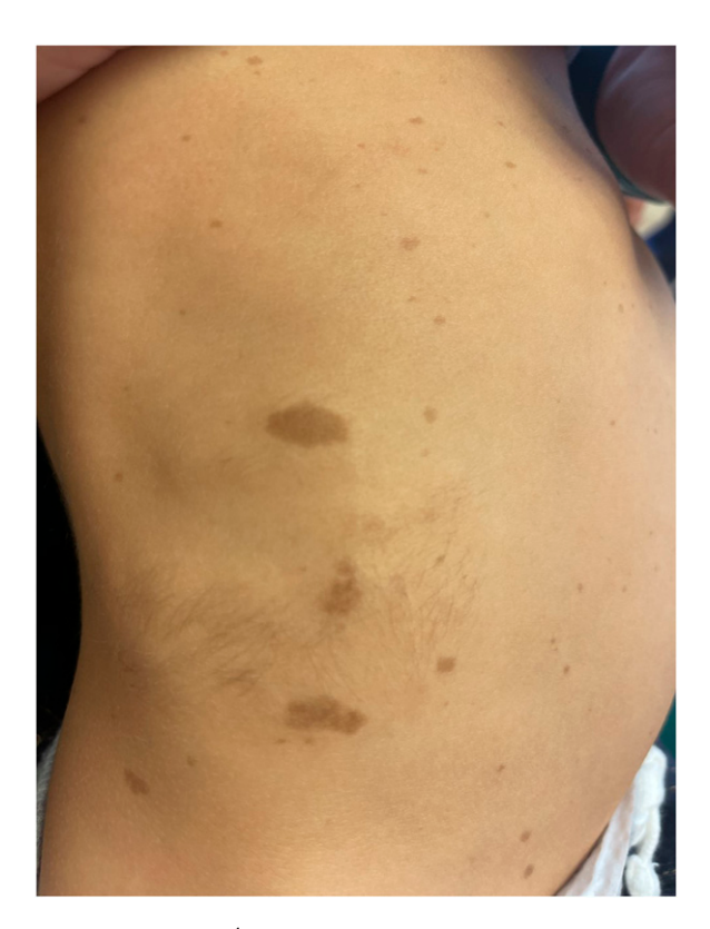
Figure 12. Multiple café-au-lait macules on trunk in neurofibromatosis.

autosomal dominant, multisystem disorder characterized by a mutation in the NF1 gene on chromosome 17 that codes for neurofibromin, a protein that regulates cell division in the nervous system. (89) The mutation causes fibrous benign tumors that originate from the central or peripheral nervous system. (90) Clinical characteristics of NF1 are age-dependent; however, \sim 97% of individuals meet the diagnostic criteria by age 8 years. (91) The most common manifestations affecting greater than 99% of NFI individuals are cutaneous neurofibromas and café au lait macules (CALMs) (Fig 12). (89) Neurofibromas can occur anywhere on the body and present as pedunculated, firm to rubbery nodules. The presence of 6 or more CALMs, greater than 5 mm prepubertal or greater than 15 mm postpubertal, and more than 2 neurofibromas or 1 plexiform neurofibroma are suggestive diagnostic findings of NF1. (89) An additional diagnostic criterion is freckling in intertriginous and sunexposed areas, seen in 85% of pediatric patients, particularly axillary freckling, referred to as the "Crowe sign", which occurs at a later age than CALMs but before the appearance of neurofibromas. (89)(92) The ophthalmological finding of 2 or more Lisch nodules is usually seen before age 5 years and with increasing appearance frequency as individuals age. (89) In addition, the presence of an optic glioma; distinctive osseous lesions, such as sphenoid wing dysplasia; or having