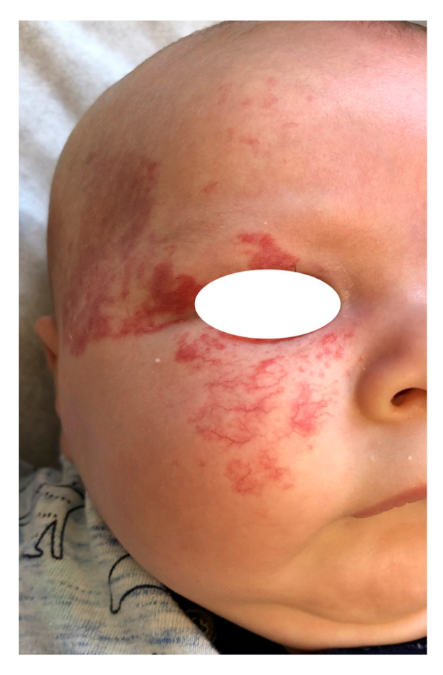
Figure 6. Segmental periocular infantile hemangioma.

The presence of segmental lumbosacral or anogenital hemangiomas (Fig 7) in association with underlying genitourinary, spinal, and renal anomalies is denoted as LUMBAR, SACRAL, or PELVIS syndrome. (55) These terms are acronyms of associated anomalies. LUMBAR stands for segmental hemangioma of the Lumbar, Urogenital abnormalities/ulceration, Myelopathy, Bony deformities, Anorectal malformations/arterial anomalies, and Rectal anomalies. SACRAL syndrome comprises segmental hemangioma of the Sacral spine/Spinal dysraphism, Anogenital anomalies, Cutaneous anomalies, Renal and urologic anomalies, Angioma of Lumbosacral localization. PELVIS stands for Perineal hemangioma, External genitalia malformations, Lipomyelomeningocele, Vesicorenal abnormalities, Imperforate anus, and Skin tag. A spinal MRI is effective in depicting the extent of the anomalies