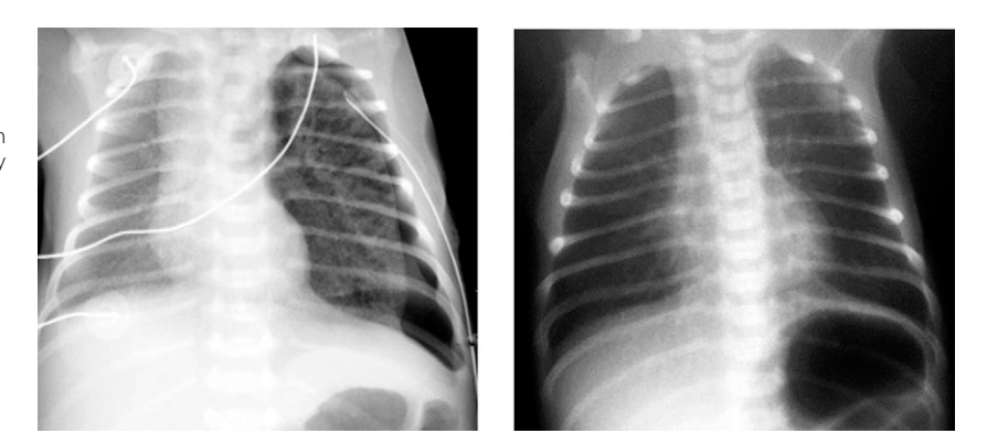
Figure 2. Common complications of meconium aspiration syndrome include pneumothorax (left upper) and persistent pulmonary hypertension of the newborn (right upper) characterized by cyanosis with normal lung fields and decreased pulmonary vascular markings.

Meconium is toxic to the newborn lung, causing inflammation and epithelial injury as it migrates distally. The pH of meconium is 7.1 to 7.2. The acidity causes airway inflammation and a chemical pneumonitis with release of cytokines. (41) As meconium reaches the small airways, partial obstruction occurs, which results in air trapping and hyperaeration. The typical chest radiograph initially appears streaky with diffuse parenchymal infiltrates. In time, lungs become hyperinflated with patchy areas of atelectasis and infiltrate amid alveolar distension (Figure 1). Surfactant is inactivated by the bile acids in meconium, resulting in localized atelectasis, so alternatively, radiographs may resemble those of RDS with low lung volumes. Although