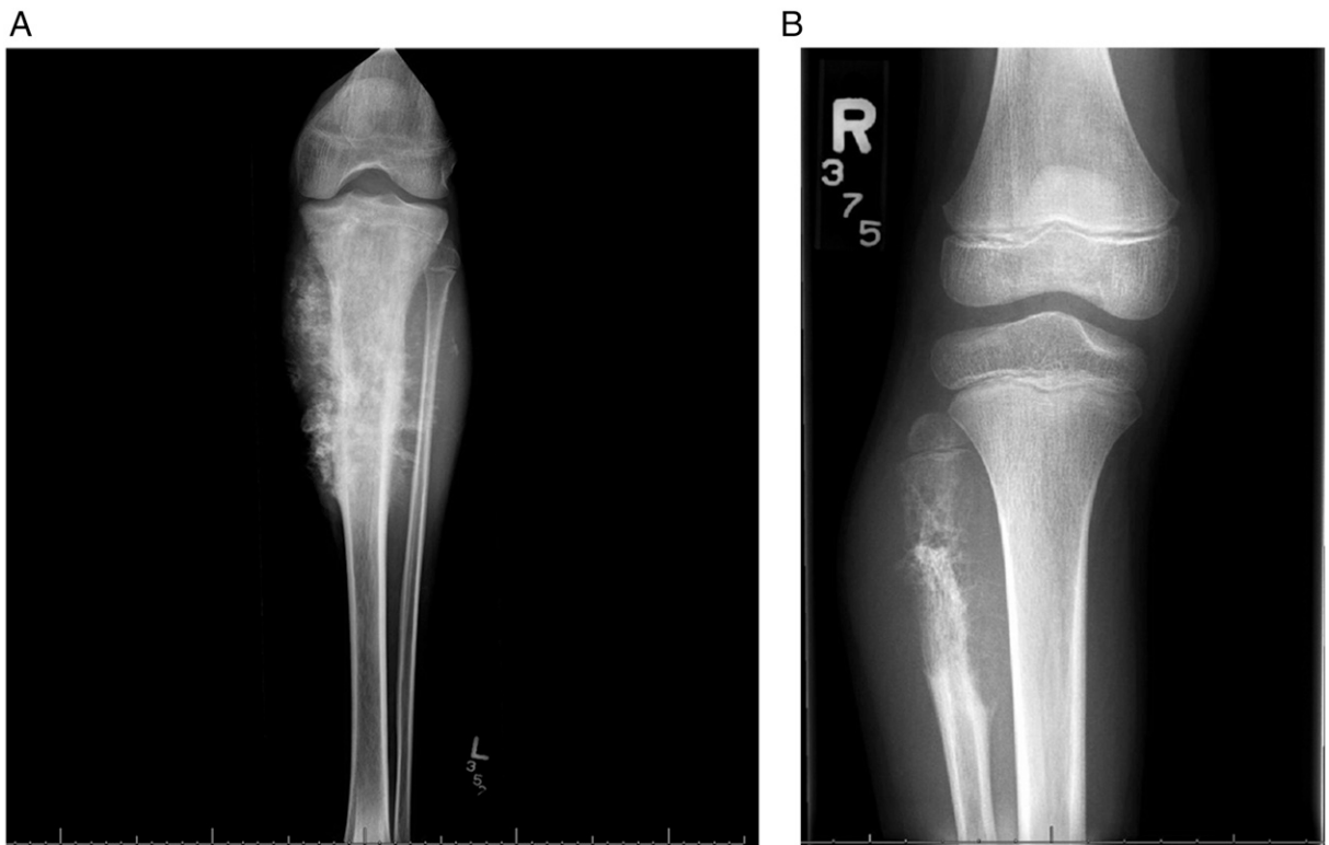
Figure 2. A. Aggressive periosteal reaction with the sunburst pattern in the proximal tibia of a patient with osteosarcoma. B. Destructive lesion with moth-eaten appearance of the proximal fibula in a patient with Ewing sarcoma.

overall survival of less than 30%. Patients with metastatic disease to the lungs have a slightly better survival rate than patients with multiple bones involved. Patients with both lung and bone metastasis have extremely poor outcomes. In addition, the percentage of tumor necrosis after neoadjuvant chemotherapy is prognostic, and patients with greater than 90% tumor necrosis have better outcomes than those with less tumor necrosis. The focus of recent clinical trials has been to intensify treatment for patients with metastatic disease and poor tumor necrosis, but the results have been disappointing and currently the treatment remains the same for both localized and metastatic disease, except for surgical resection of all sites of metastasis.